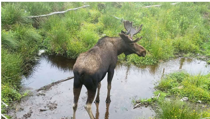
A bull Moose