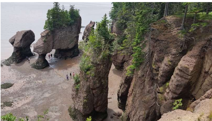
Hopewell Rocks, New Brunswick