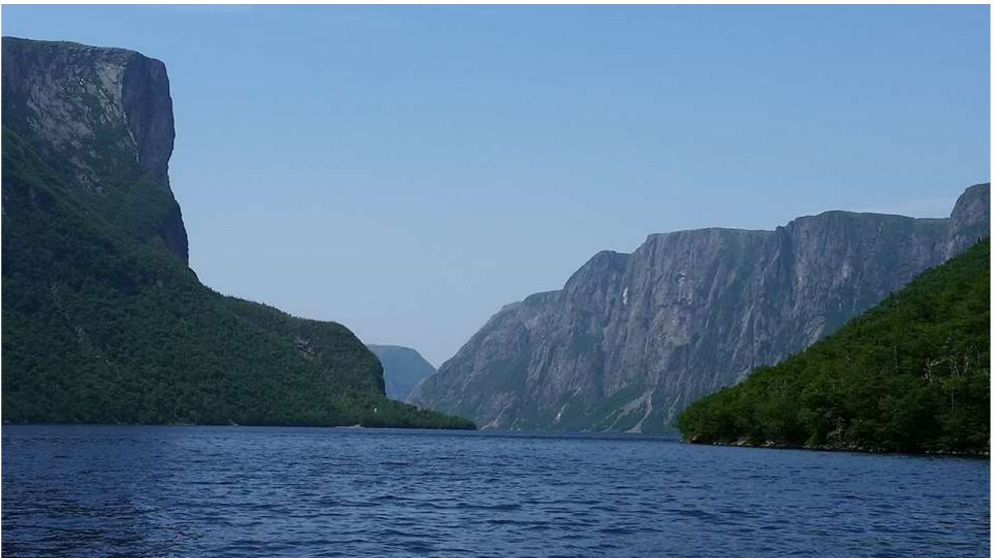
Western Brook Pond in Gros Morne National Park

Tablelands. It is one of the few places on earth one can see the earth's mantle that was exposed when continental collisions created the Appalachian Mountains 480 millions years ago. It almost had a Mars like feel to it. We enjoyed also checking out a lot of unique vegetation not seen in the mid-Atlantic US. We then had lunch at a small seafood restaurant in the tiny fishing village of Woody Point. The next day we broke camp and headed north toward our next basecamp.