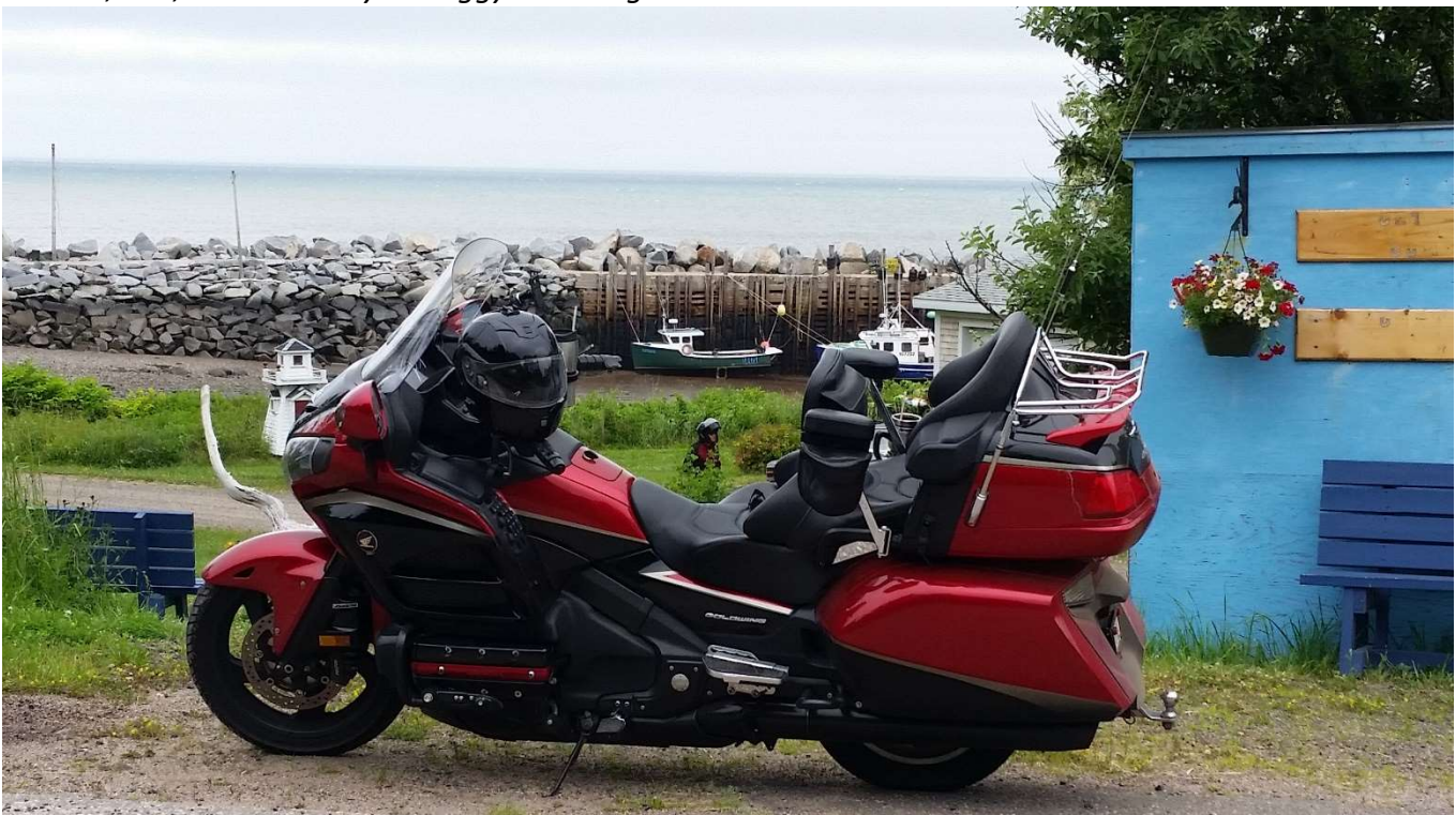
Gary and Lisa's 2015 with low tide grounded fishing boats in background along Bay of Fundy.