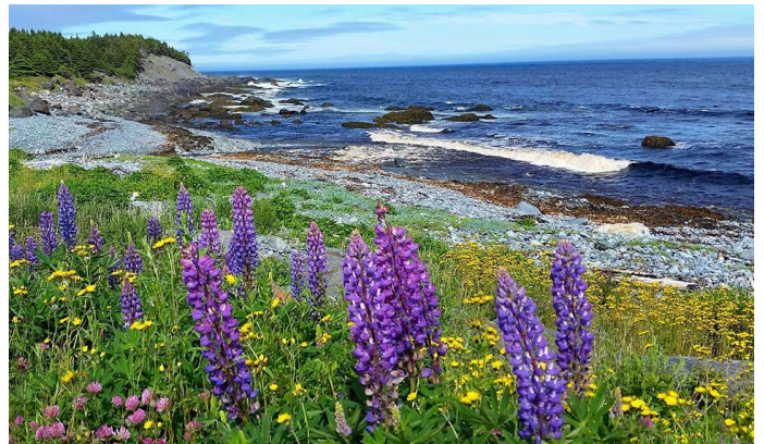
Coastline on the Avalon Peninsula