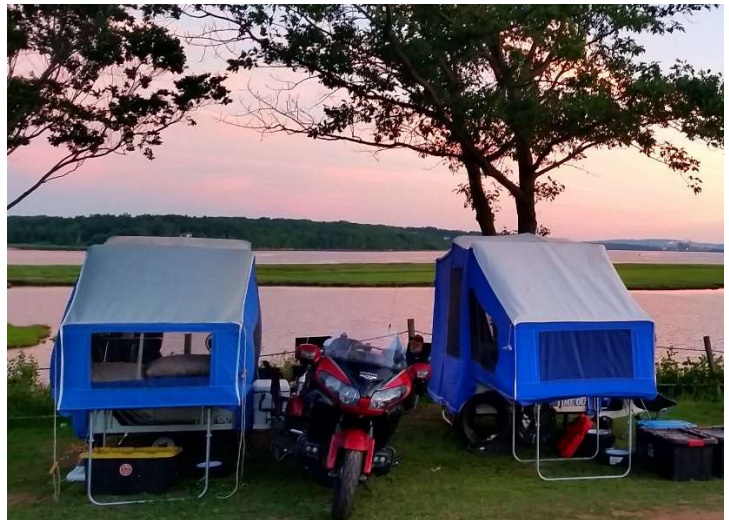
Camp at Pictou, Nova Scotia