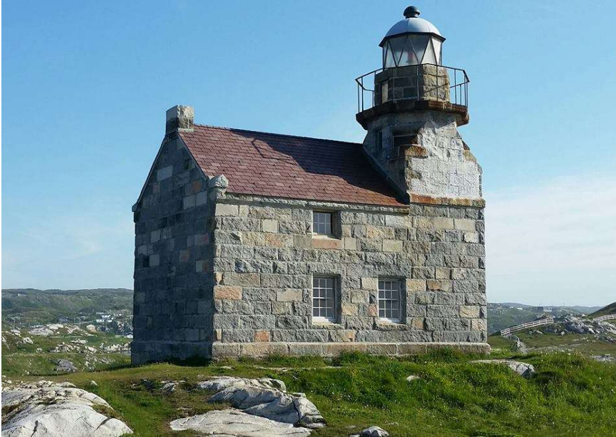
Rose Blanche Lighthouse

After exiting the overnight ferry from Nova Scotia, we drove to the Rose Blanche and Cape Ray lighthouses along the southwestern Newfoundland coast. We then drove to Gros Morne National Park and setup our basecamp. The next day we made a short drive north to the Western Brook Pond trailhead. We did a hike to a dock where we boarded a tour boat into the deep gorge at Western Brook Pond. This is an absolutely must do activity for anyone visiting Newfoundland in our opinion. After tour and the hike back, we made a stop at Lobster Cove Head Lighthouse. The next day we drove along the Trout River to an area referred to as the