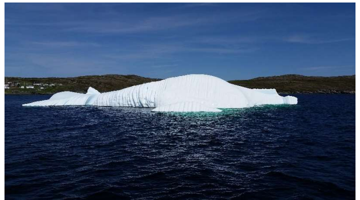
Iceberg off coast of Newfoundland