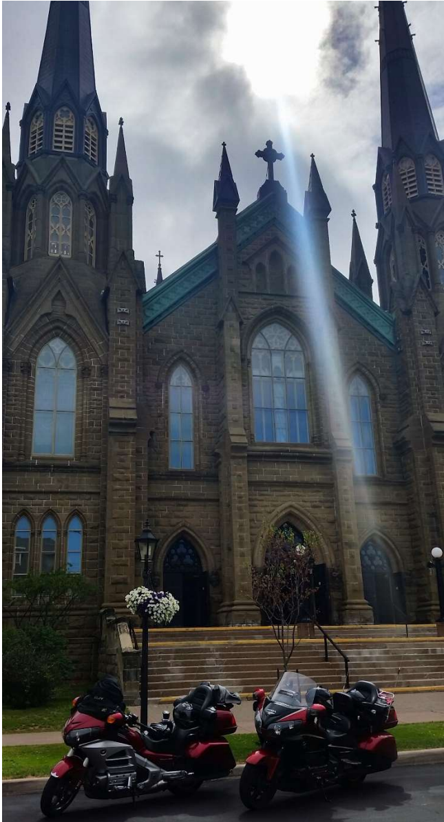
St. Dunstan's Basilica