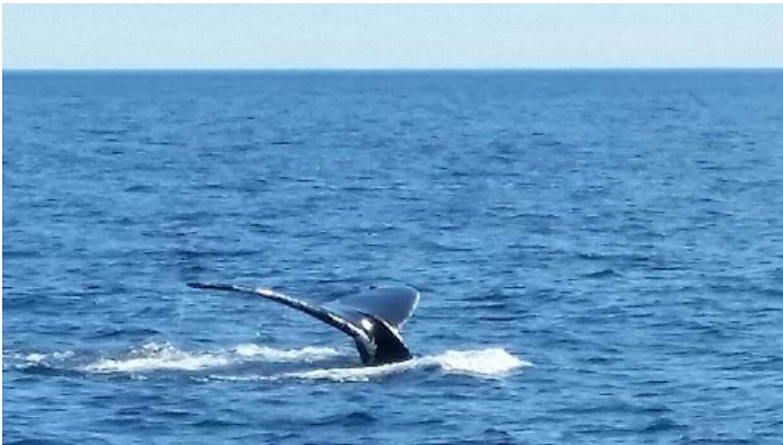
Humpback whale feeding