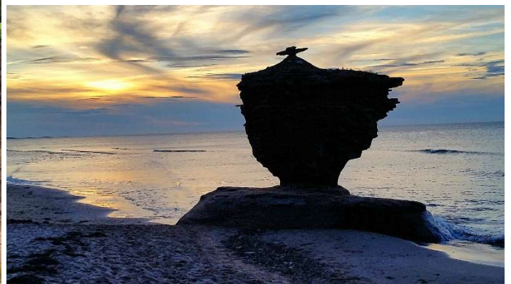
Teacup Rock, Thunder Cove Beach, PEI