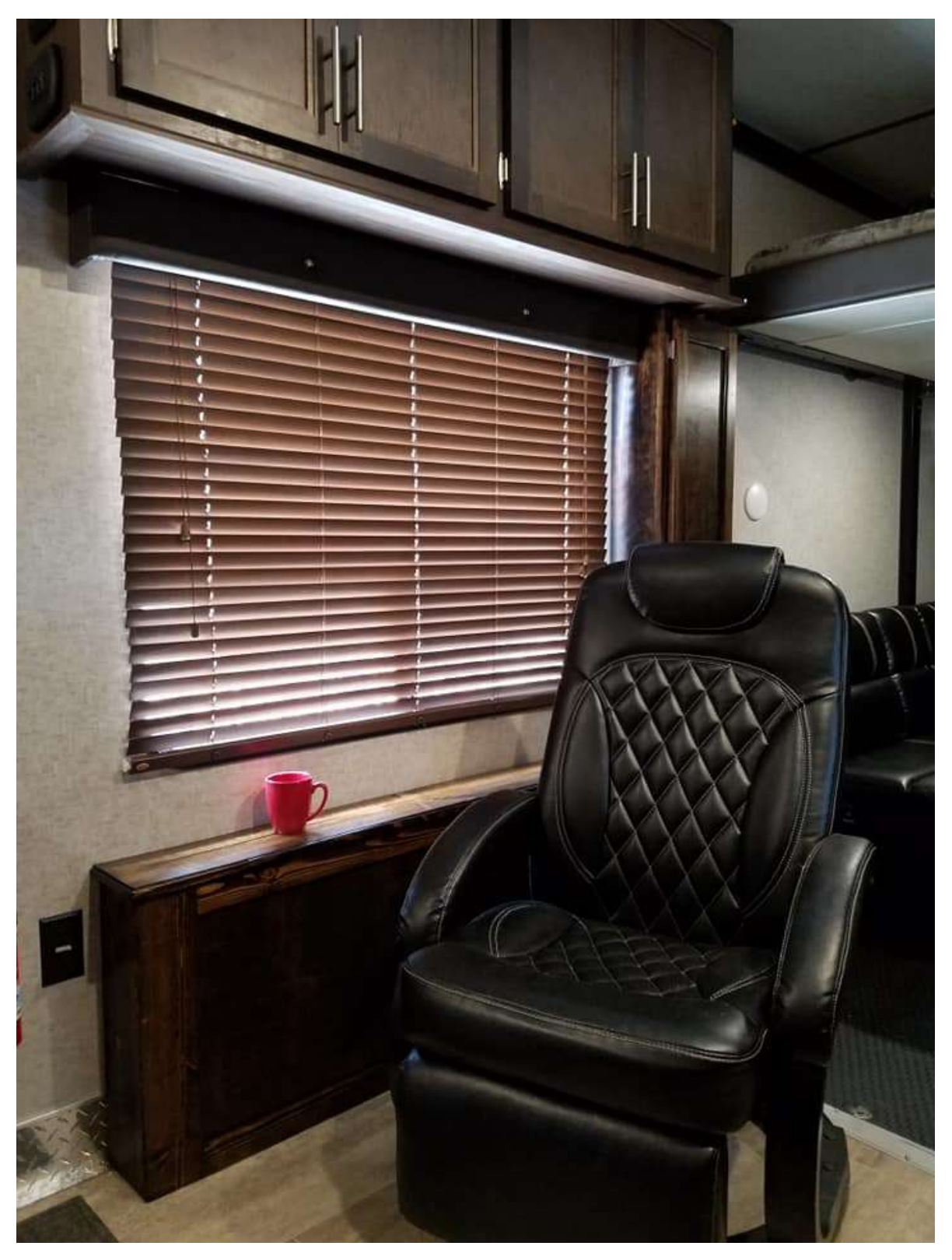
For more tips and tricks, visit \underline{www.macesoftware.com}